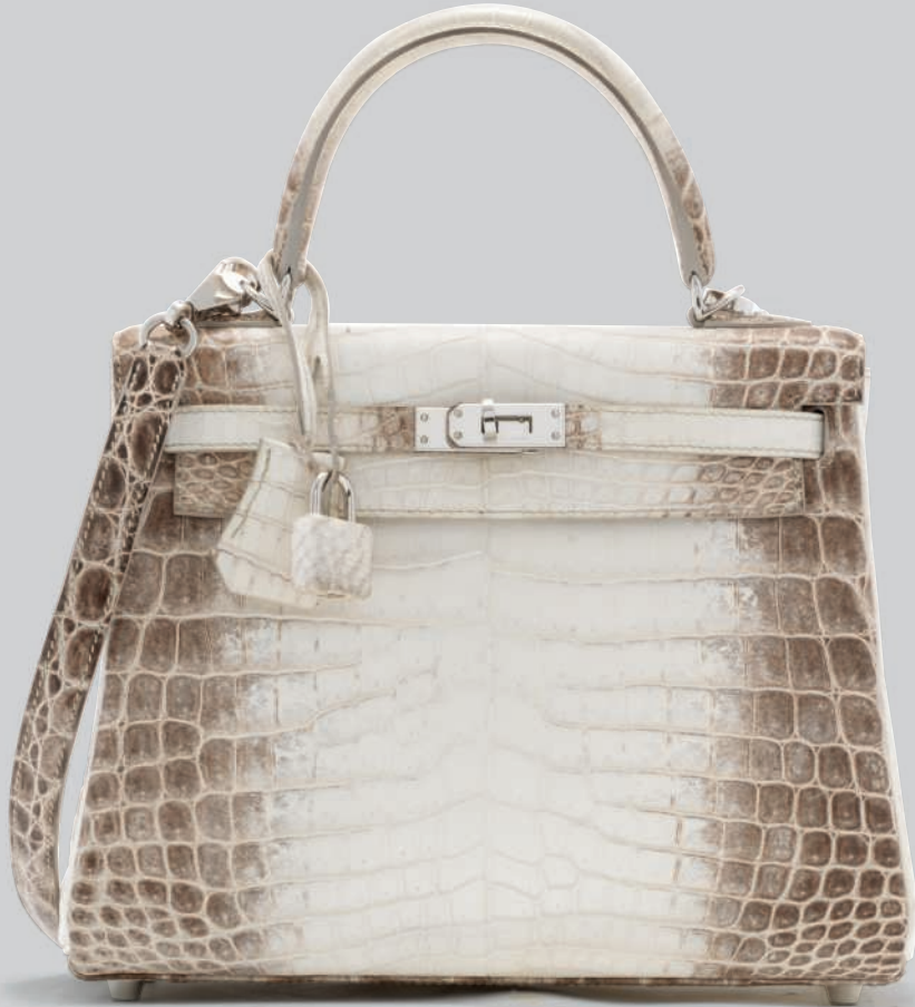
A RARE, MATTE WHITE HIMALAYA NILOTICUS CROCODILE KELLY 25 WITH PALLADIUM HARDWARE, HERMÈS, 2015 ESTIMATE UPON REQUEST